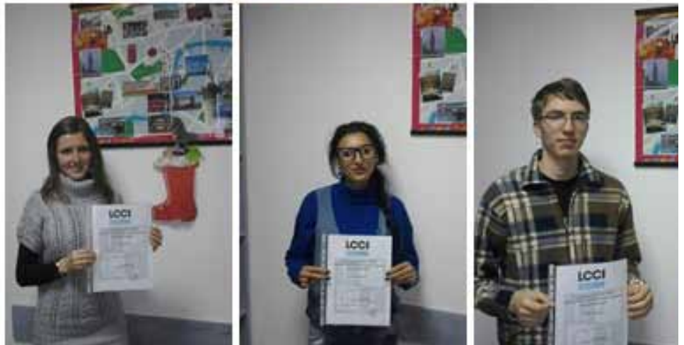
Winners and English language teachers at Centrul de Limbi Straine EUREKA from Reghin.